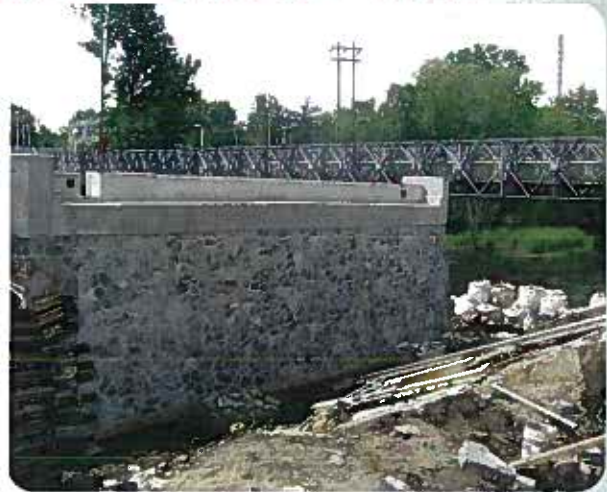
Temporary 206-foot by 15-foot Mabey Panel Bridge for pedestrians and utilities is made of standardized galvanized steel components assembled on the job.

The replacement, however, is the genuine thing — a timber covered bridge with a 94-foot span that integrates Howe main trusses, roof trusses and floor beams into a single structural entity. Invented and patented in 1840 by William Howe, an American architect born in Spencer, Mass., the Howe truss bears the roof and floor beam loads. It incorporates timber top and bottom chords, crisscrossing timber diagonal members called struts and counter braces, wood verticals and post-tensioned vertical steel rods.