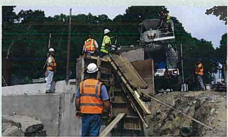
Aggregate Industries supplies 5000 psi ready mix as workers place concrete for abutment wing wall.

the soil beneath the site of the south pier called for the installation of driven battered H-piles. And to protect the area around the pier from erosion due to river current, a 10-foot by 6.5-foot bulwark of riprap, modified rockfill and crushed stone was created next to the pier footing. To