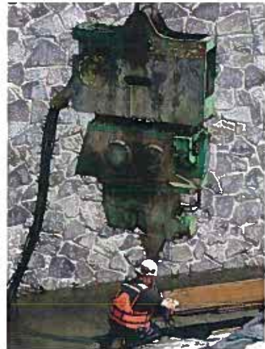
Worker wearing flotation vest for protection in volatile river disconnects sheet pile from ICE 28B tributary extractor.

The new Pepperell covered bridge is expected to be finished in October 2009. ■