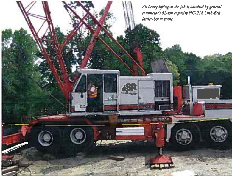
All heavy lifting at the job is handled by general contractor's 82-ton capacity HC-218 Link-Belt lattice-boom crane.

According to HDR, a nationwide consulting firm whose Boston office designed the Pepperell covered bridge, the diagonal struts carry primary compression loads while the vertical rods and bearing plates cause the diagonal counter braces, usually members in tension, to remain in compression under moving (traffic) loads. In a nod to modern construction techniques, the trusses will be made of glulams — engineered glued laminated wood — instead of solid timbers, and are capable of handling HS-20 vehicle loads.